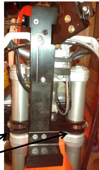
Black rubber cushions

Jerry Lund 612.802.6469 trailfast@gmail.com midwestme.com