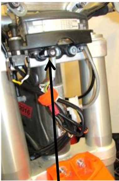
The picture above shows standoff located at odometer, and the Velcro wire wrap.

Jerry Lund 612.802.6469 trailfast@gmail.com midwestme.com